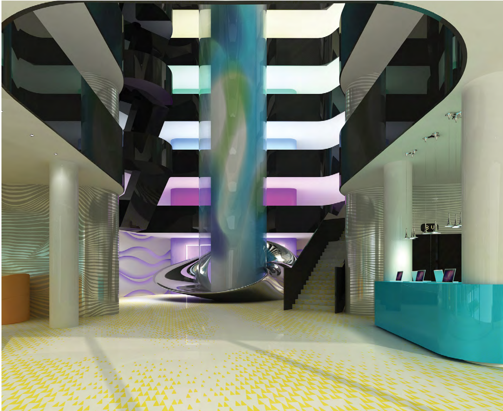
Lobby Artist impression