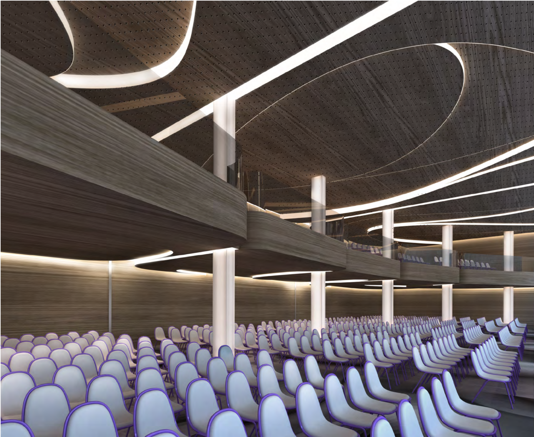
Ballroom Area Artist impression